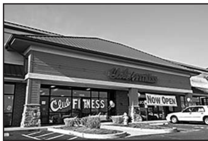
The Fifth Street Club Fitness in St. Charles donated memberships to Youth In Need's Transitional Living Program so the teens could work out at no cost.