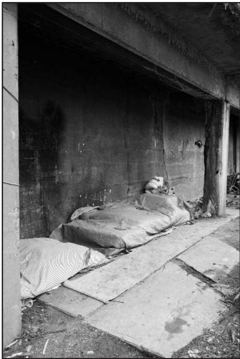
Support Youth In Need's So Every Child Has a Future Capital Campaign. Your support helps Youth In Need ensure that every child has a bedroom in which to sleep.

Y outh In Need is poised to move forward to complete its So Every Child Has a Future Capital Campaign by August 31, 2008.