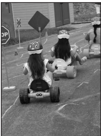
Three girls enjoy the bicycle safety course.

Seven area Target stores partnered exclusively with Youth In Need to provide a St. Charles County National Night Out celebration from 6 to 8 p.m. on Aug. 5 at Youth In Need's central office in St. Charles.