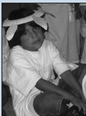
An OST student wears his creation of the Olympic wreath.

opening ceremony. Some students made and wore Olympic wreaths; others carried their creation of the Olympic torch. With T-shirts displaying the Olympic rings, the young athletes sang, performed step demonstrations and celebrated their physical abilities. At the close of the ceremony, each participant received a gold medal to remind them of the Olympic creed: "The most important thing in the games is not to win but to take part." ■