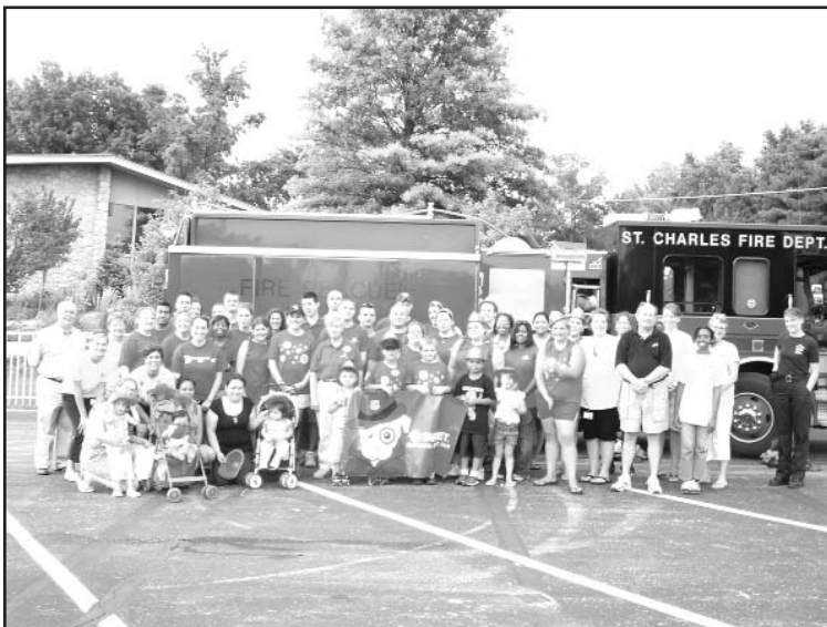
Target employees, Youth In Need staff and client families pose with the St. Charles Fire Department truck. Fire fighters were on hand to show children the inside of the fire truck and to give away child-sized fire hats.

Locally, the seven Target stores (St. Charles, St. Peters, Florissant, Dardenne Prairie, Wentzville and O'Fallon, Mo., and Alton, Ill.) promoted the event by including fliers in shopping bags prior to Aug. 5. ■