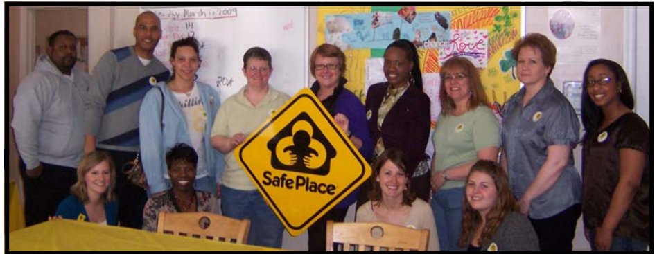
Staff members from Youth In Need's Emergency Shelter, Street Outreach Program and Safe Place Program pose for a group photo before guests arrive.