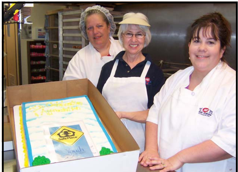
Safe Place site Mid-Towne IGA baked a delicious cake featuring the Safe Place logo for all to enjoy at the second Annual Open House.

Would you like to receive "Safe Place, Safe Kids, Safe Community" via e-mail?