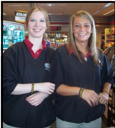
QuikTrip employees wear their Safe Place bracelets to raise awareness during National Safe Place Week.