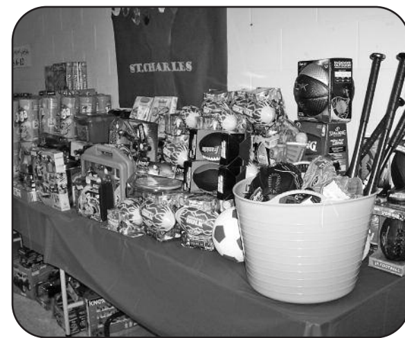
Presents piled high at Youth In Need before staff select gifts for children in their programs.

The generosity you, your business or organization shows will brighten the spirits and holiday season for thousands of deserving children and families. Thank you for supporting Youth In Need!