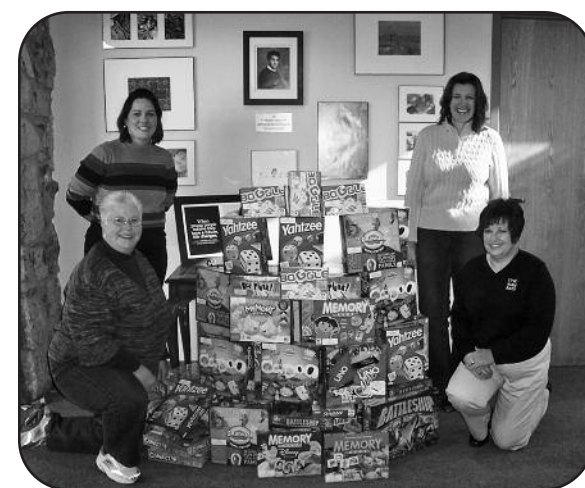
Members of the Cottleville Rotary display gifts of games for boys and girls of every age.