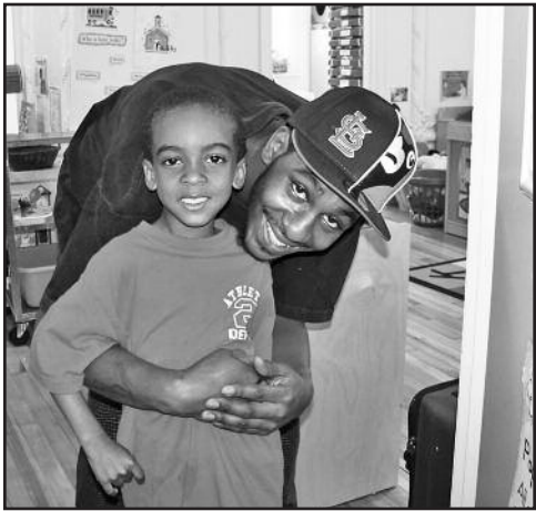
Parent involvement is a critical component of the Head Start program's philosophy. Youth In Need's St. Louis City Head Start Center frequently offers parents the opportunity to participate in activities with their children. The Center has held Mother's and Father's Day celebrations, special breakfasts and performances.

T hree Youth In Need service areas recently participated in triennial peer reviews, in which external teams reviewed programs to ensure compliance with regulations established by the U.S. Department of Health and Human Services.